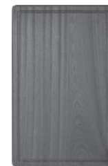
ECB1910 Cutting Board