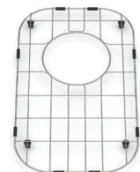
Bottom Grid EBGD1610