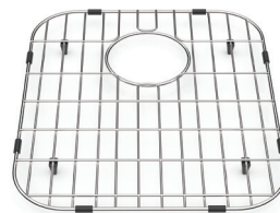
Bottom Grid EBGD1614