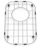
EBGD1610 Bottom Grid