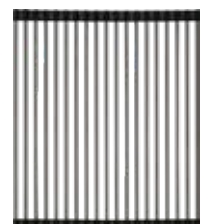
ERM1814 Roll Mat