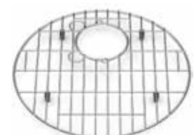
Bottom Grid EBGD16R