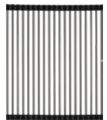
ERM1914 Roll Mat