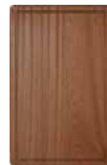
ECB1910 Cutting Board