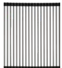
ERM1814 Roll Mat