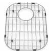
Bottom Grid EBGD1613