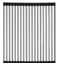
ERM1814 Roll Mat