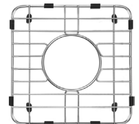
Bottom Grid EBGD1012