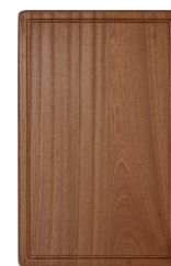
ECB1910 Countertop Cutting Board