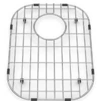
EBGD1613 Bottom Grid