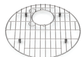
Bottom Grid EBGD16R