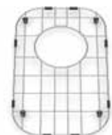
Bottom Grid EBGD1610